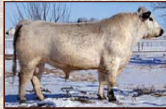
A&W 15R SIRE OF LOT 12

Notta Pretender 4T was the First lady Classic winner at Agribition 2008. She is a Lacerta grand daughter that has lots of eye appeal. We bred her to A&W 15R who's dam also carries the traits that we look for. We feel these embryos will be one of a kind.