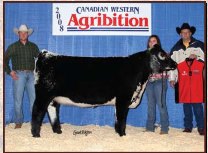
Notta 2R Pretender 4T - Dam of Lot 12