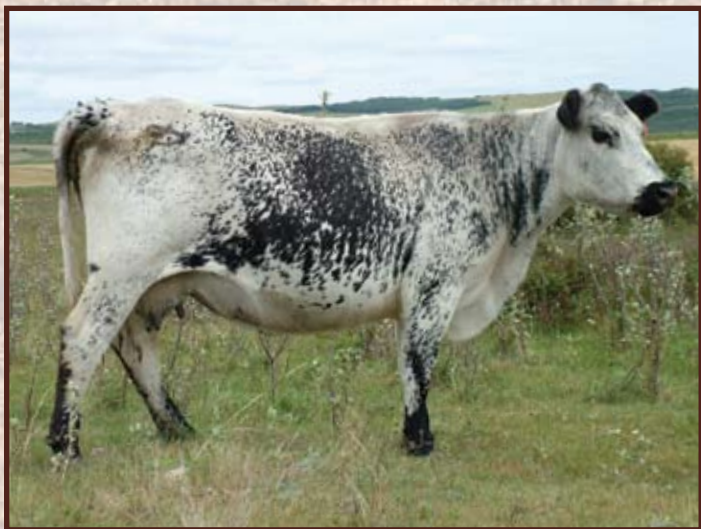
Lot 1 - Star Bank 46R