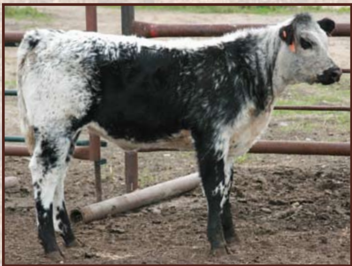
Lot 8 - Six Star Commercial Heifer