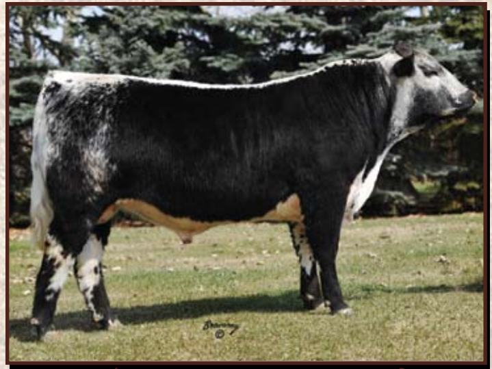
Star Bank King George 82U - Sire of Lot 13

Star Bank 85S is one of our hard working cows that never misses. We have bred her to King George who has with out a doubt put the best calves on the ground in Canada and Australia.