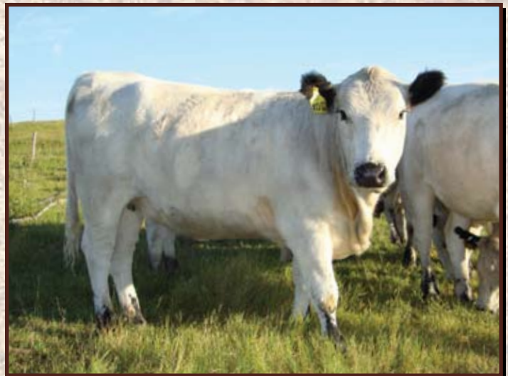
Lot 18 - Spots 'N Sprouts 20X

Exposed to Spots 'N Sprouts Expert 102X (3417 - PB) from May 28, 2011 to August 19, 2011.