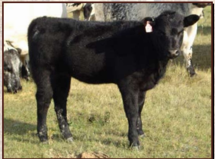
Lot 20 - Spots 'N Sprouts 32Y

Exposed to Spots 'N Sprouts Expert 102X (3417 - PB) from May 28, 2011 to August 19, 2011.