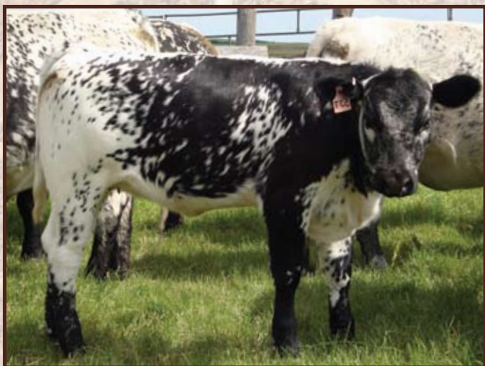
Lot 24 - Spots 'N Sprouts Commercial Heifer 52Y

Here's another good commercial heifer that would be an asset to anyone's herd.