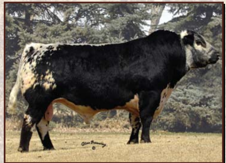
Lot 14 - Star Bank Lacerta 68L - Semen Lot