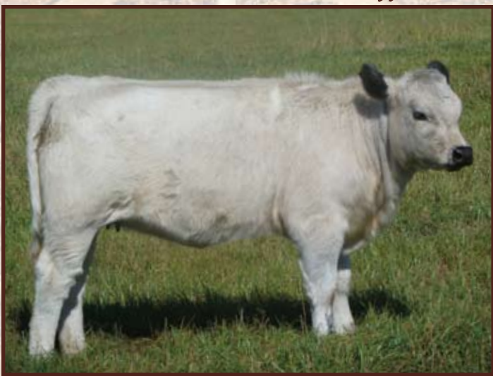
Lot 29 - River Hill Yamela 98Y