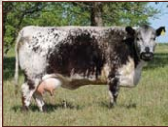
DAM OF A&W 15R SERVICE SIRE TO LOTS 1-5