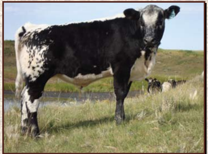
Lot 26 - Spots 'N Sprouts Steer Calf 12

This is a nice smooth steer calf with a good top line. He'd make a great 4-H prospect or perhaps a candidate for the Calgary Stampede carcass competition.