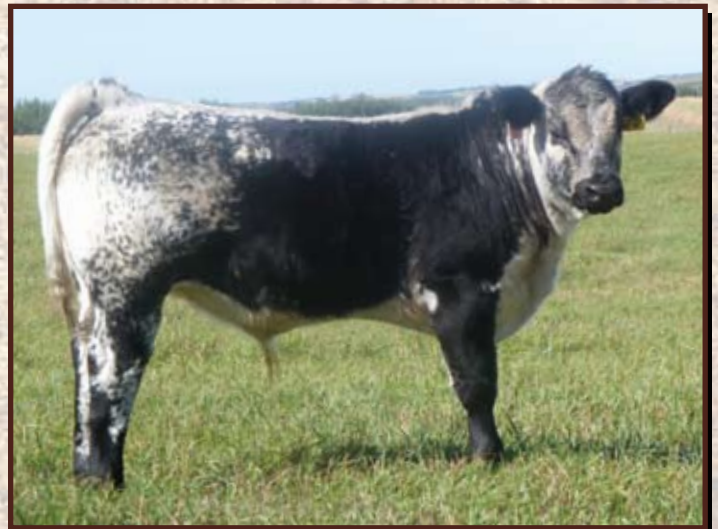
Lot 32 - River Hill Commercial Steer 94