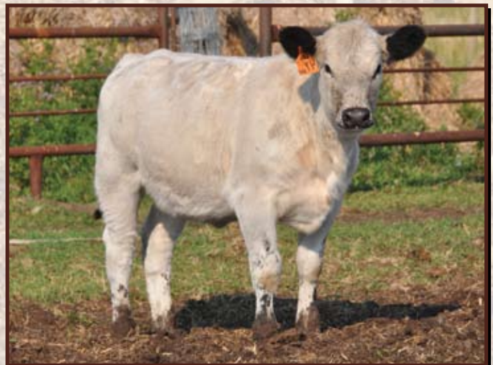
Lot 7 - Six Star 4Y

4Y is a sharp looking, correct heifer sired by Lacerta, out of Star Bank 50J. 50J is one of the best donors in our flush program.