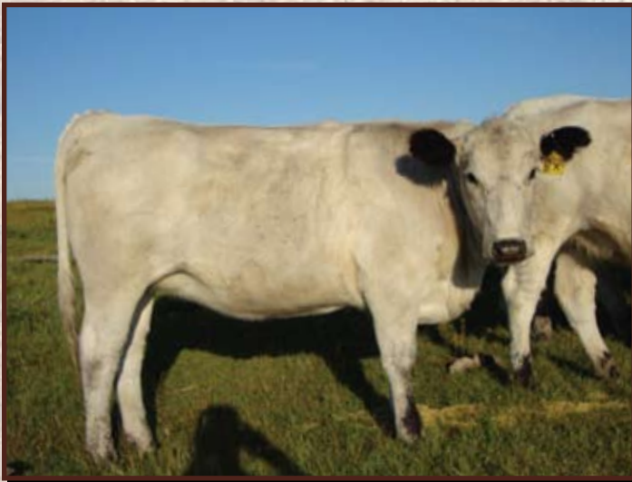
Lot 15 - Spots 'N Sprouts 8X