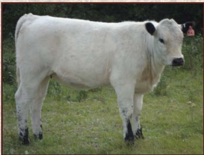
Lot 23 - Spots 'N Sprouts Commercial Heifer 51Y

Here's another good black heifer to start a herd with or to add to an already established herd.