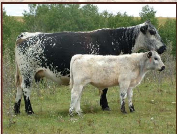
Lot 4 - Star Bank 4S