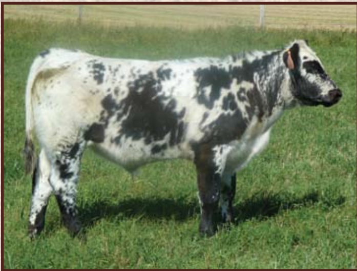
Lot 36 - River Hill Commercial Steer Rose