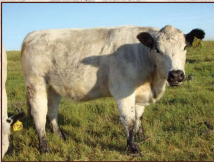
Lot 16 - Spots 'N Sprouts 11X

Exposed to Spots 'N Sprouts Expert 102X (3417 - PB) from May 28, 2011 to August 19, 2011.