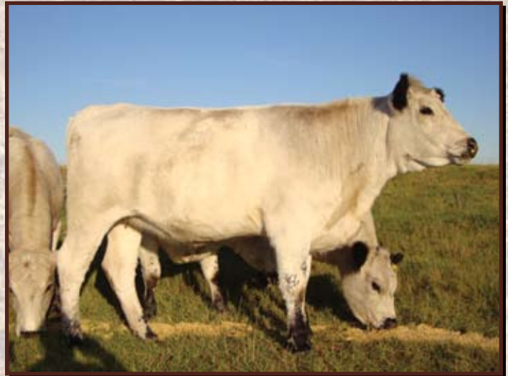
Lot 17 - Spots 'N Sprouts 15X

Exposed to Spots 'N Sprouts Expert 102X (3417 - PB) from May 28, 2011 to August 19, 2011.