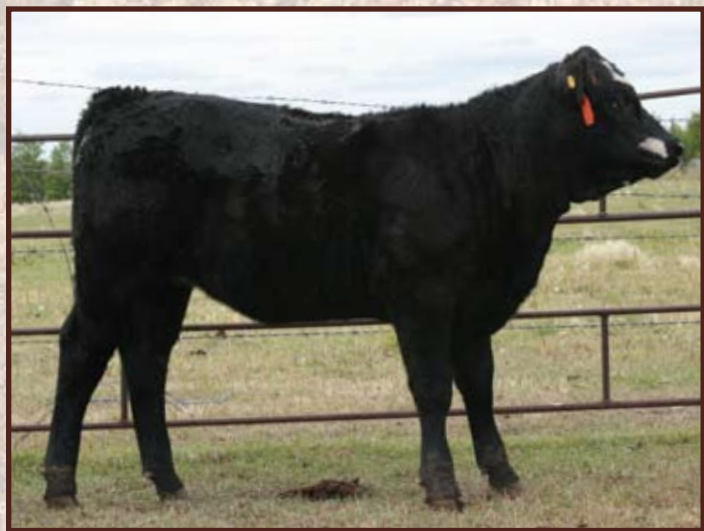
Lot 9 - Six Star Commercial Heifer