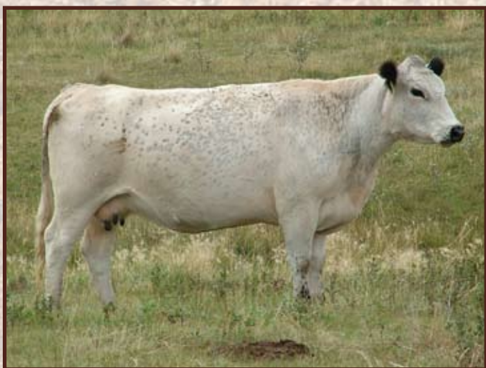
Lot 3 - Star Bank 1S