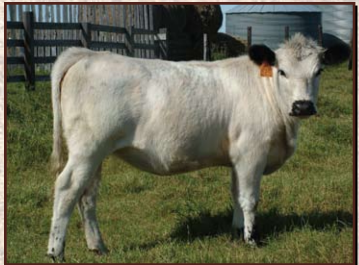
Lot 6 - Six Star 25X

Six Star 25X is a great heifer that is going to grow into an even better cow.