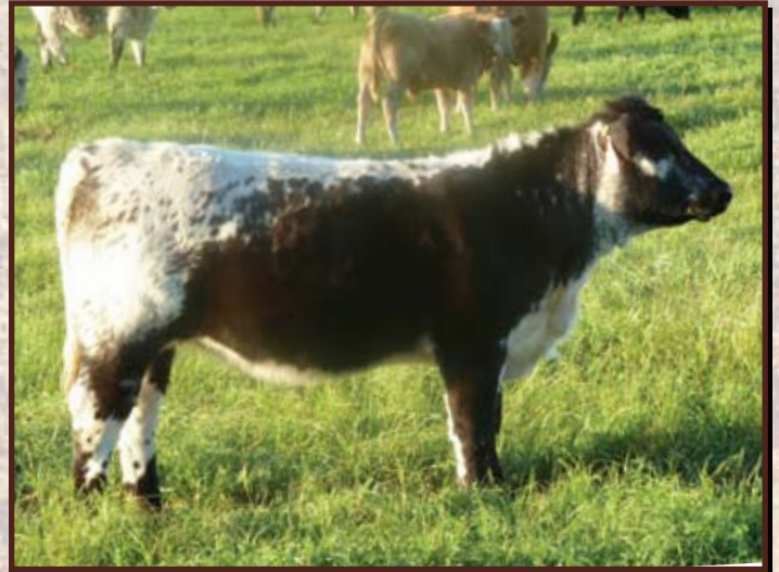
Lot 31 - River Hill Commercial Heifer Jill

This showy heifer is from a Red Angus Cow with an excellent udder. The sire is a son of Moo Fassa. We have other offspring from this Dam in our herd.