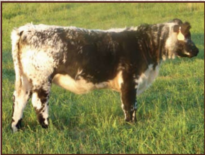
Lot 28 - River Hill 101U Yola 35Y