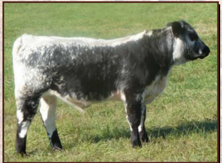
Lot 33 - River Hill Commercial Steer Ash