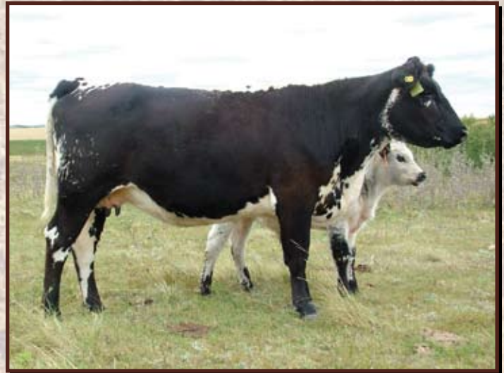
Lot 5 - Star Bank 92U