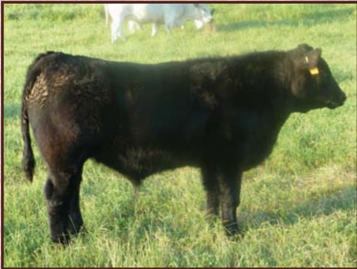
Lot 35 - River Hill Commercial Steer Pebbles