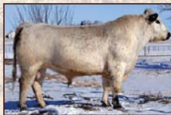
A&W 15R SERVICE SIRE TO LOTS 1-5

Star Bank 36R is a great cow up for grabs. She is a 3/4 sister to Star Bank Lacerta 68L.