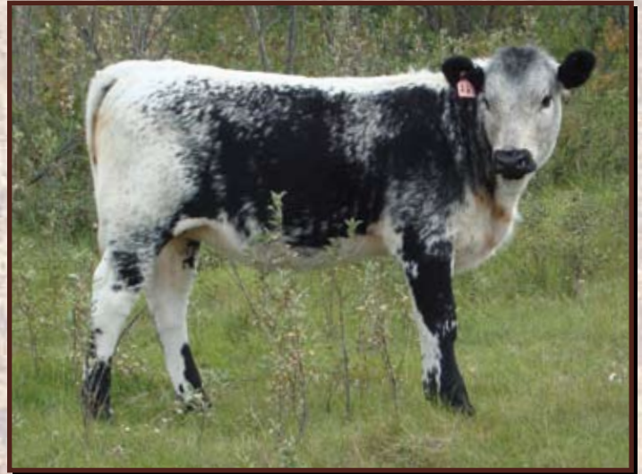
Lot 25 - Spots 'N Sprouts Commercial Heifer 50Y

We have entered these commercial females in the sale so breeders who aren't into purebreds can still enjoy the benefits of the breed. Their docile natures also make them a good choice for 4-H.