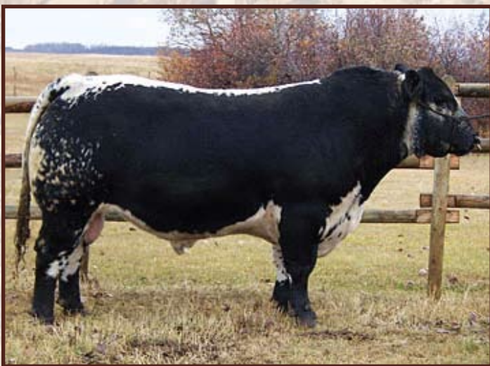
Lot 37 - Semen Lot - River Hill Traffic Jam 26T