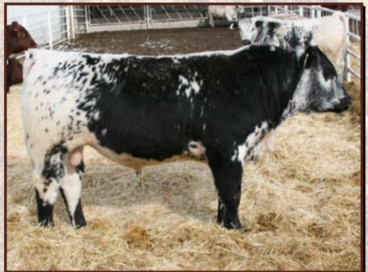
Lot 27 - Spots 'N Sprouts Wampum 102W - Semen Lot

Exportable to U.S. and Australia SELLING 10 STRAWS