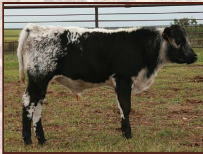
Lot 11 - Six Star Commercial Steer

This Star Bank Lacerta cross steer is a later born calf with the potential to be a colorful 4-H project.