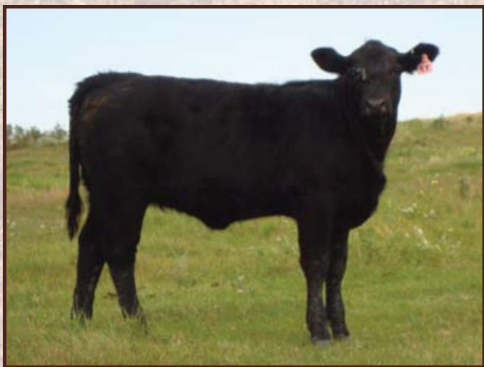
Lot 21 - Spots 'N Sprouts 31Y

21 Spots 'N Sprouts 31Y 96.6% BW: 70 FEMALE JKH 31Y PENDING 02/04/11 HWY. 4 SPECKLE PARK 20K SPOTS 'N SPROUTS UTOPIA 104U SPOTS 'N SPROUTS 8L SPOTS 'N SPROUTS 9T STYALS PATRIOT 9P STYALS LUCKY LADY 6P